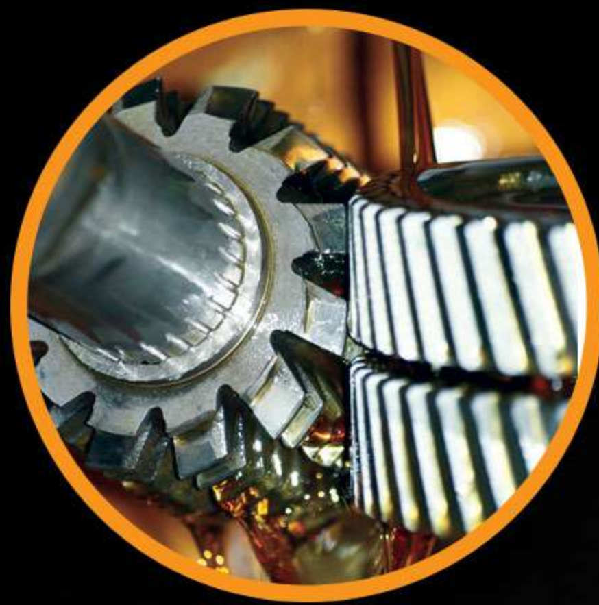
LUBRICANT & GREASE

The company manufacture its registered ZOLTON & HIPPOL branded Automotive / Industrial & Marine Lubricants. These brands are being formulated using highly refined mineral base oils, synthetic Olyfin Co-Polymer (OCP) and best quality performance improving additives. The grades are generally of dual purpose and can be used for both gasoline and diesel powered vehicles. Our brands are available in both Multigrades and Monogrades with a series of products to select from that satisfies customer's needs and ensure maximum performance and protection to their engine. Our company is also involved in local sale and export of Group I & Group II Base Oil both in bulk and in drums.